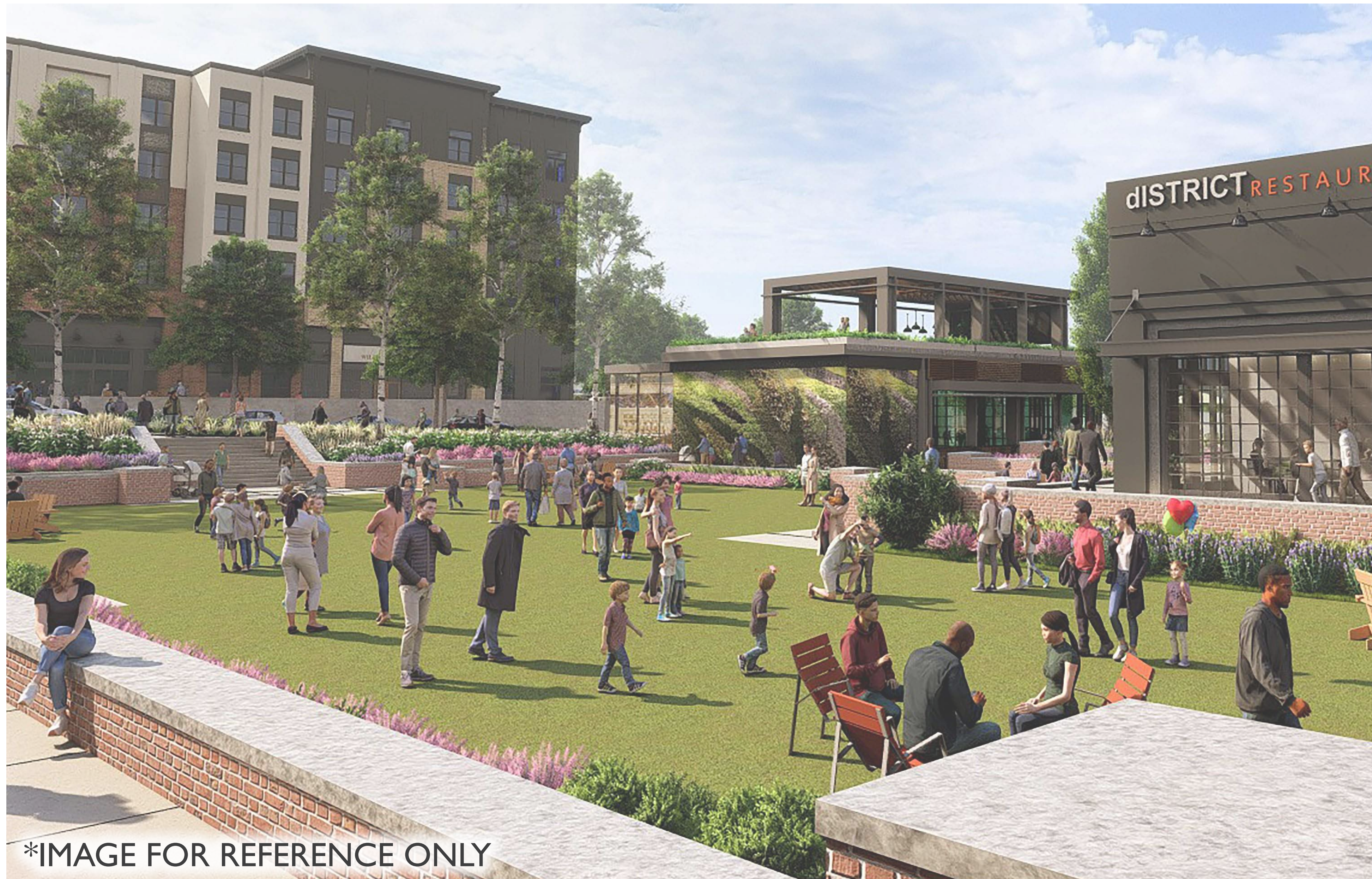
*IMAGE FOR REFERENCE ONLY