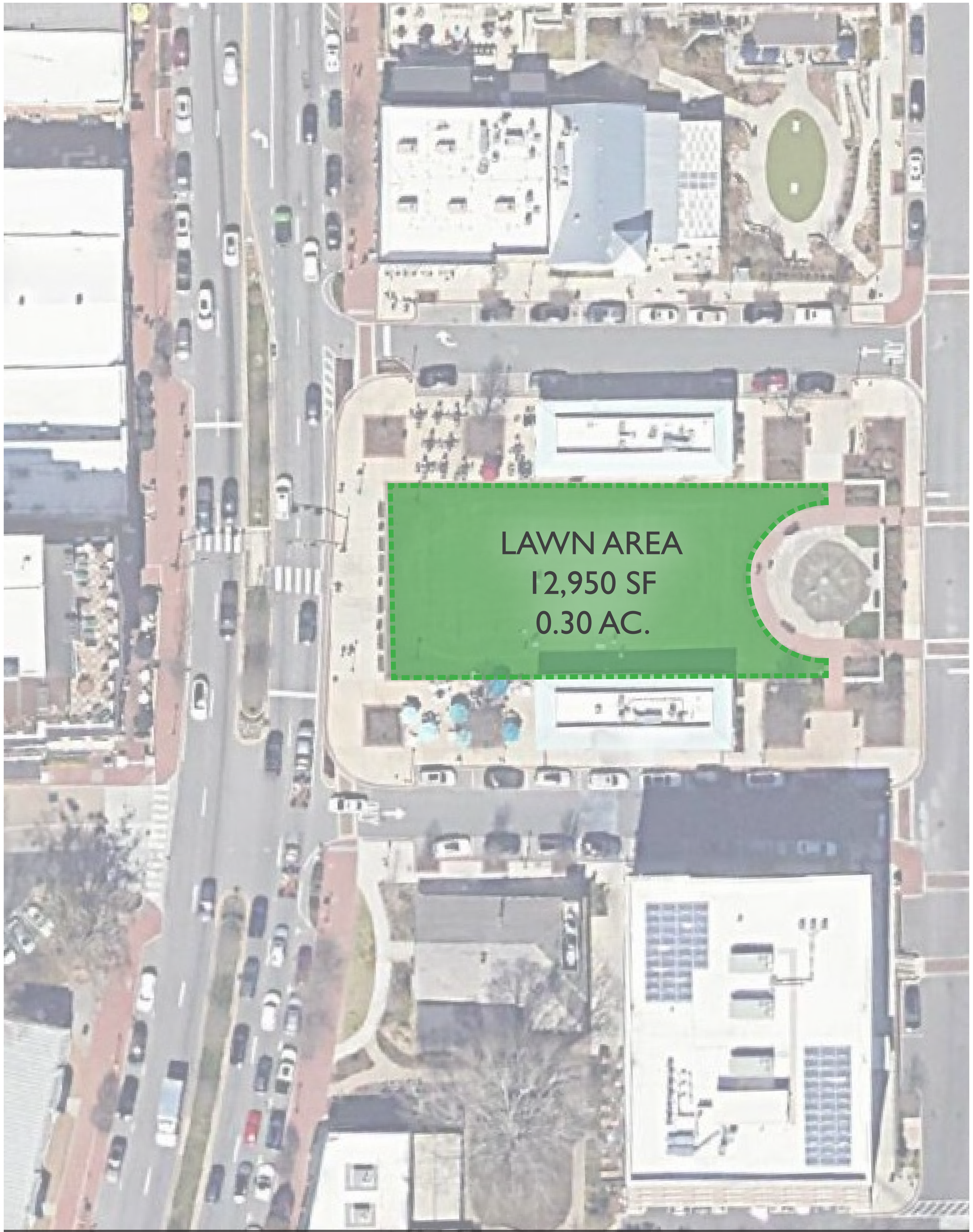
ALPHARETTA TOWN GREEN